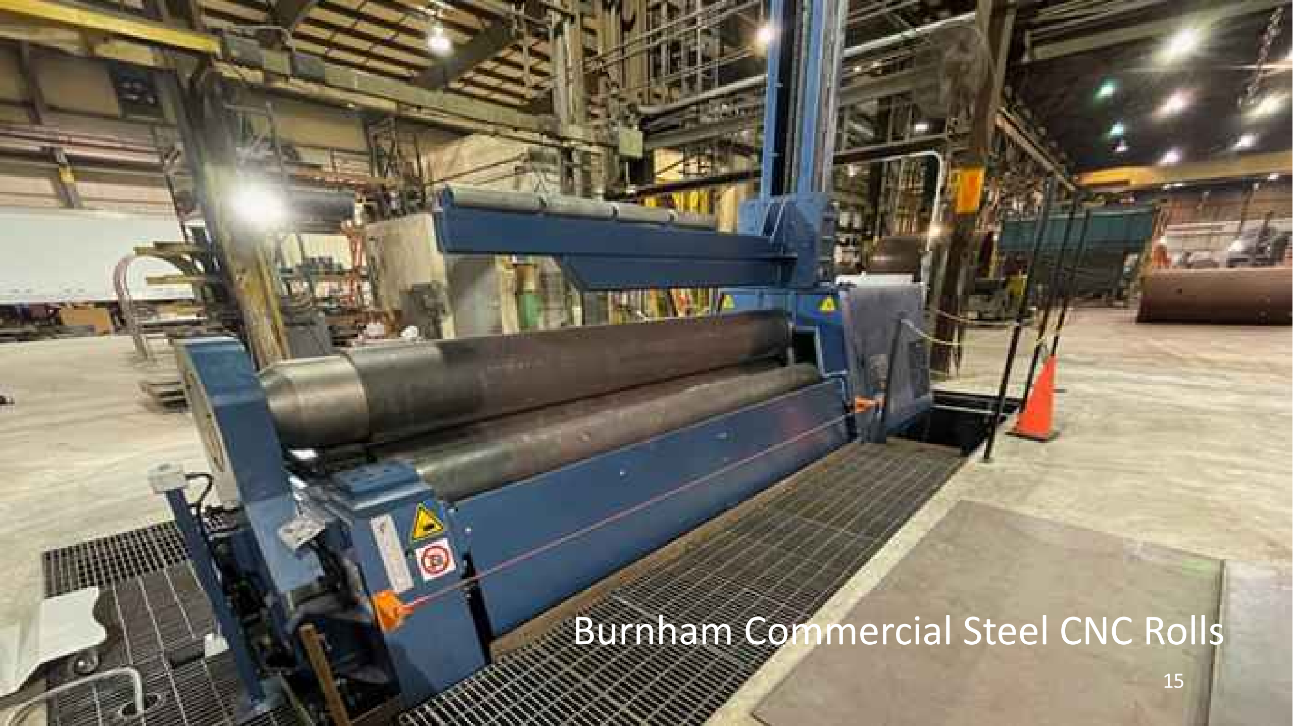
Burnham Commercial Steel CNC Rolls