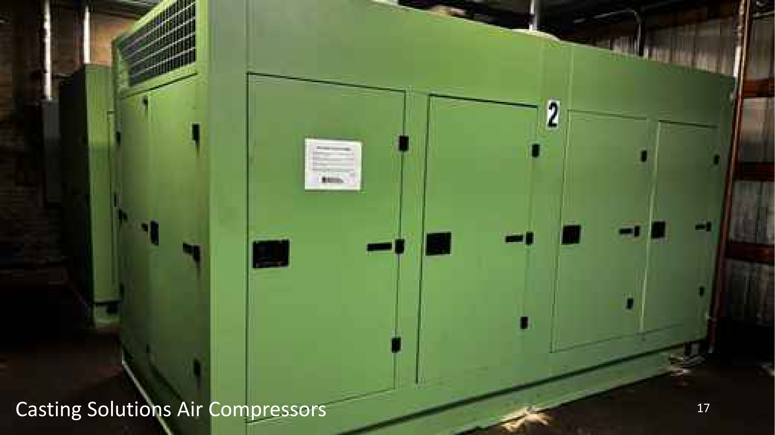
Casting Solutions Air Compressors