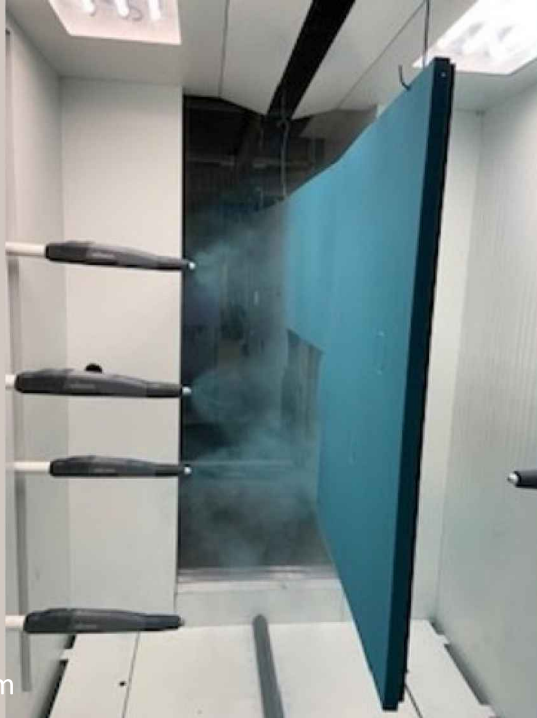
Lancaster Metal Paint System