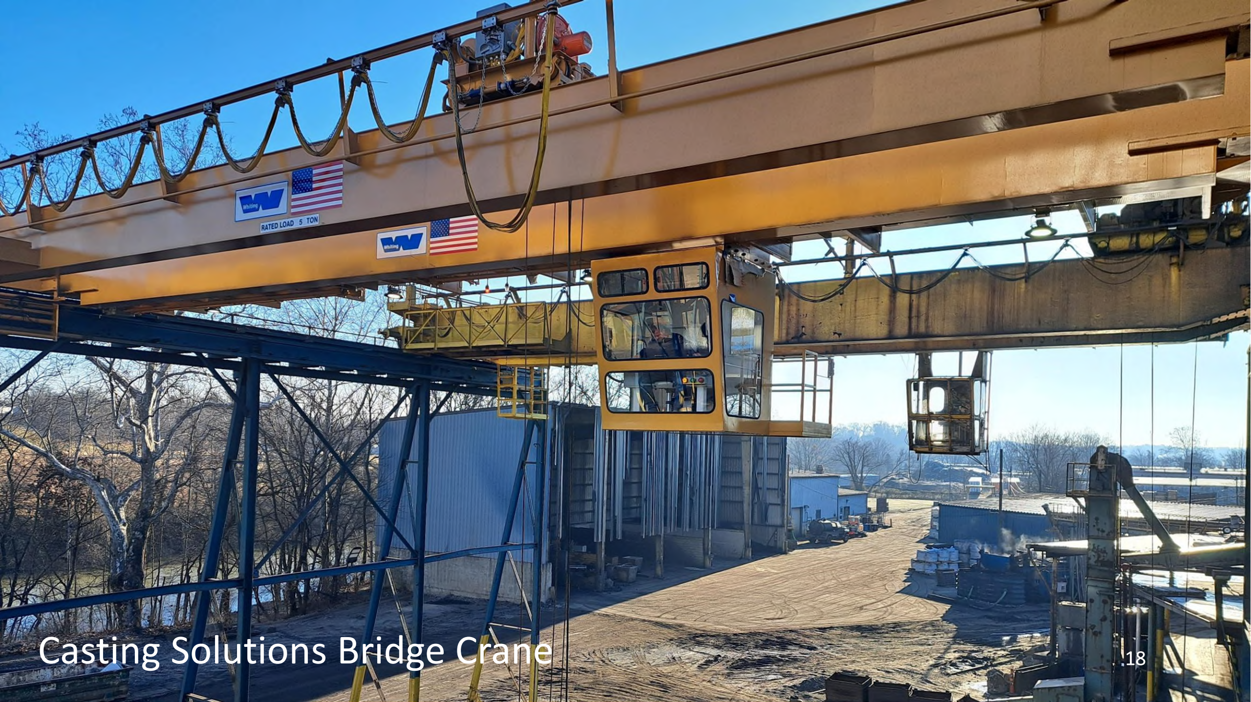
Casting Solutions Bridge Crane